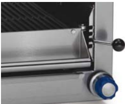
Raises and lowers with four locking positions.