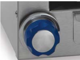
Durable cast aluminum control knobs with a heat protection, vylox grip.